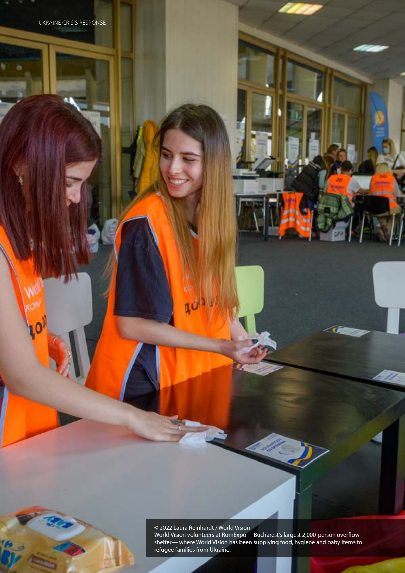
World Vision volunteers at RomExpo —Bucharest's largest 2,000-person overflow shelter— where World Vision has been supplying food, hygiene and baby items to refugee families from Ukraine.