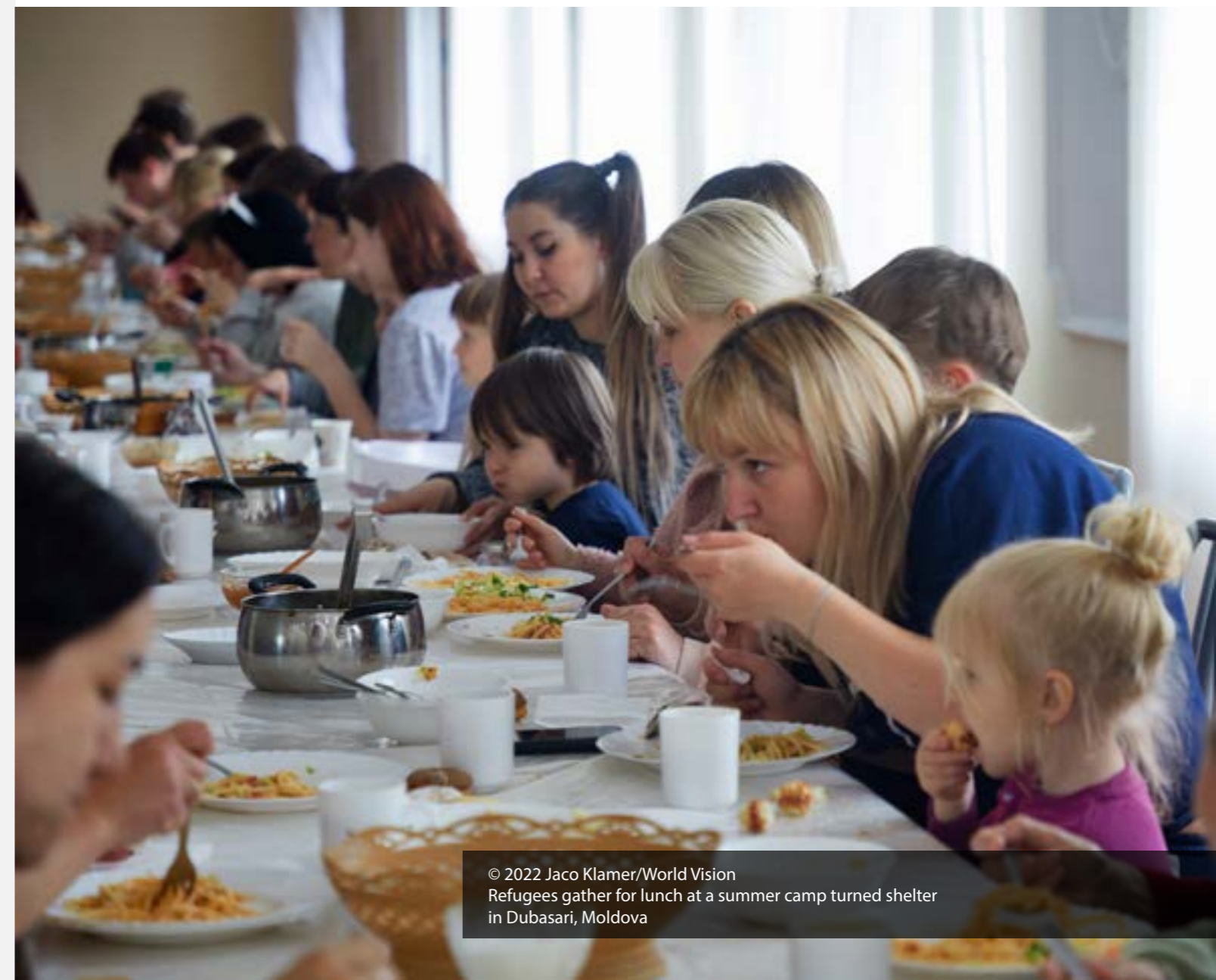
Refugees gather for lunch at a summer camp turned shelter in Dubasari, Moldova

An adequate security architecture, required due to the operational challenges, is being put in place, including security field operations and a security trainer focal point for staff and partners. The response's security protocols and procedures are in accordance with World Vision's Security Policy and Core Security Requirements for High-Risk Contexts.